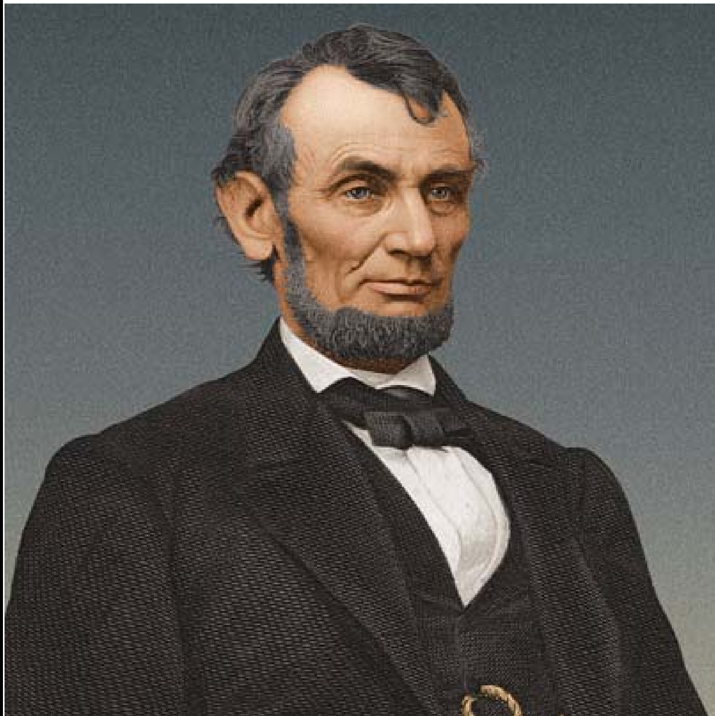
President Abraham Lincoln