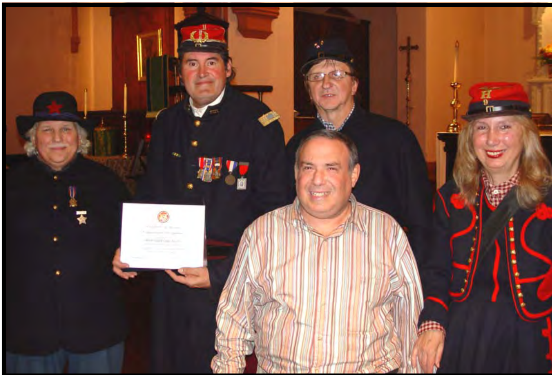
At the Greenpoint Monitor Museum "Road Show" Award Ceremony, Oliver Tilden Camp #26, SUVCW was awarded a Congressional Award from Congresswoman Nydia M. Velazquez .