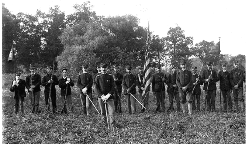
Oliver Tilden Camp #26, S.V.U.S.A. - Camp Bolster on Sept. 2, 1901

125th Anniversary Captain Oliver Tilden Camp #26, SUVCW