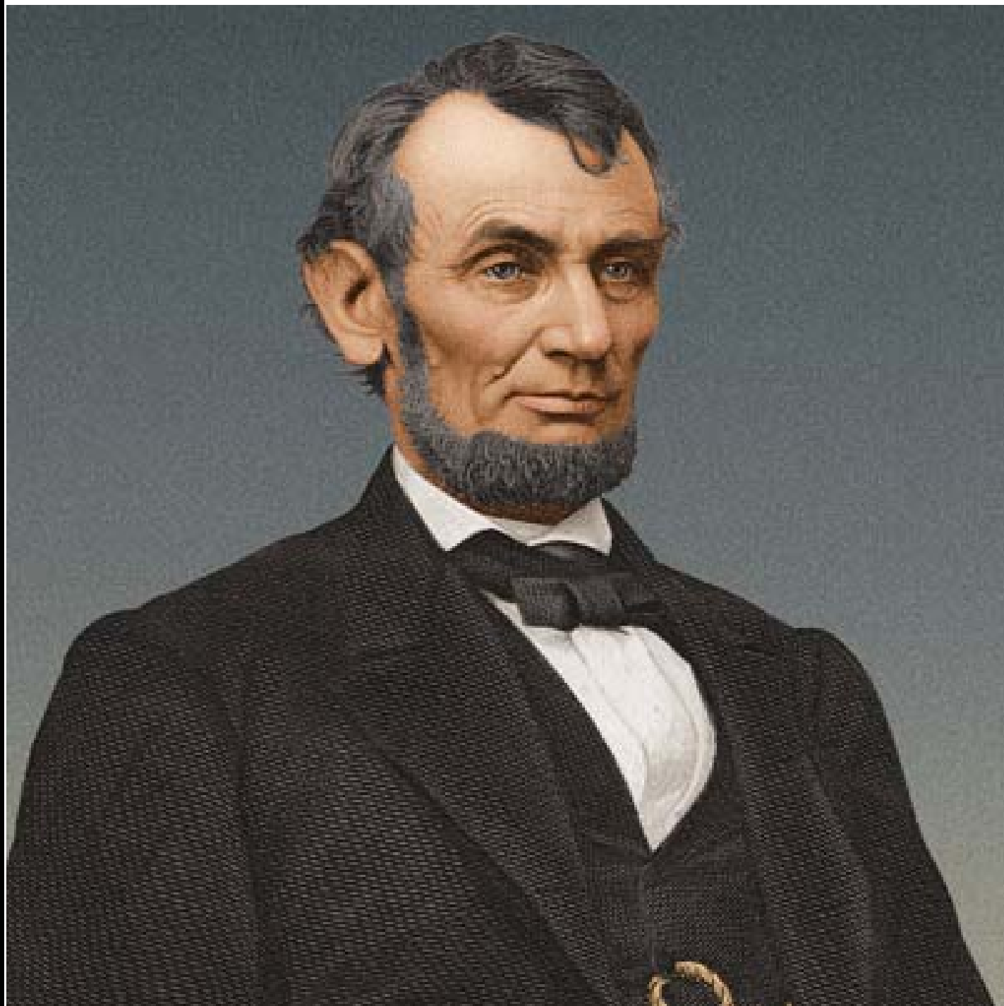
President Abraham Lincoln